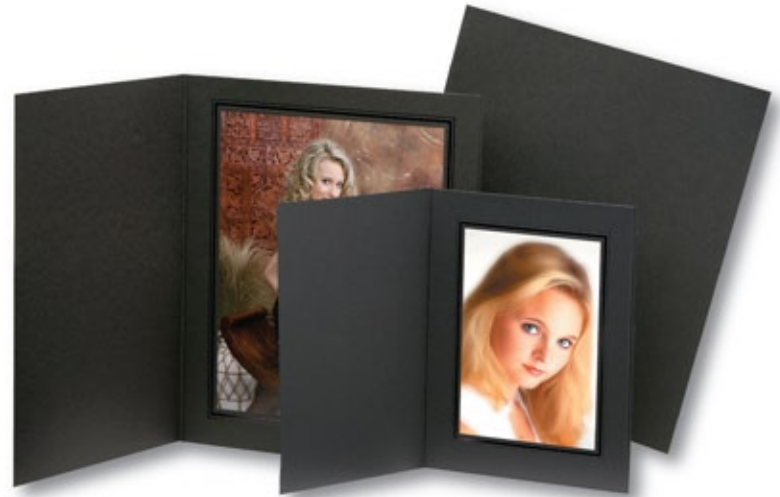
Onyx – High quality paper folder